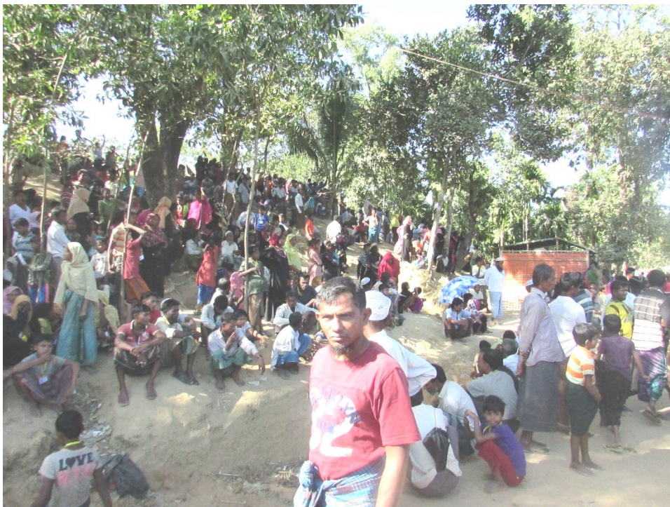
Refugees waiting for hand-outs of essential supplies – UN and other agencies.