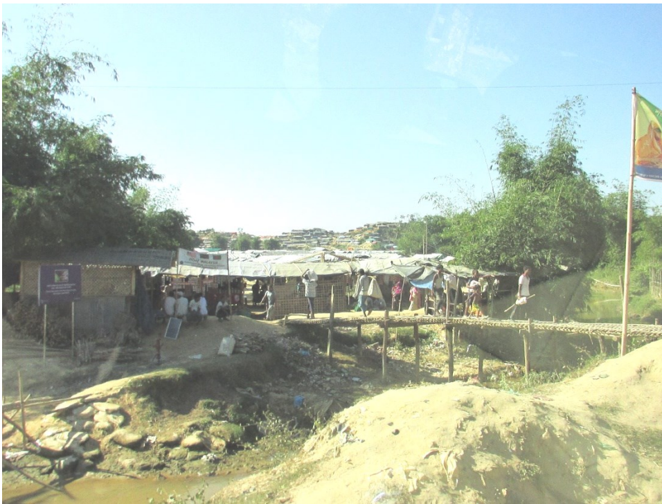
Entrance over a bamboo bridge to a well-ordered refugee camp.