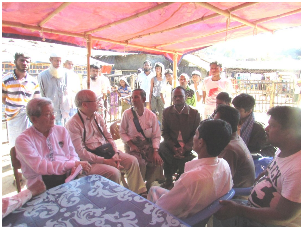
Refugees recounting their experiences.

Some of their stories about the brutality of the Myanmar security forces are just too appalling. An old man told me how his daughter was gang-raped. His son tried to intervene and had his throat slit. He tried to intervene and had his leg damaged. His daughter's throat was also slit.